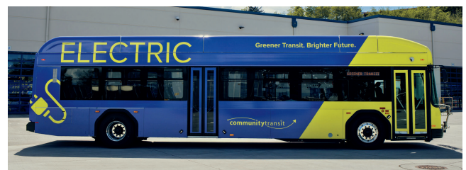
Community Transit envisions a mixed fleet of BEB and FCEB to best serve our communities.

Stay up-to-date at: communitytransit.org/zeroemissions