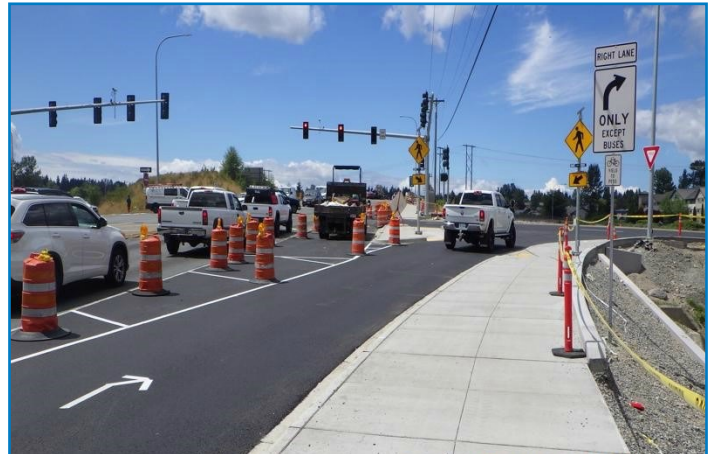
The new lane extends from 3rd Ave. SE to northbound I-5.

At the traffic signal, buses in the new lane will get a special "queue jump" green light several seconds before other vehicles, allowing the bus to move ahead. A similar bus-only lane opened on the other side of the I-5 overpass in January.